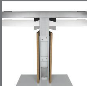
TABLE: HEIGHT ADJUSTABLE LEG