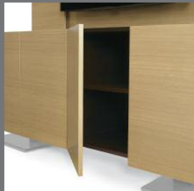
CREDENZA ADJUSTABLE SHELF