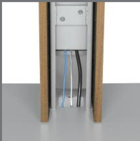
TABLE: WIRE MANAGEMENT