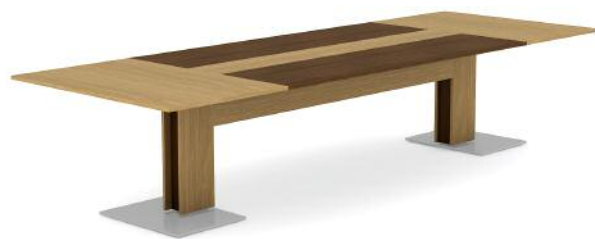
MODULAR WITH TECHNOLOGY TROUGH WITH CONTRASTING DOORS