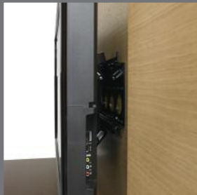
CREDENZA: MONITOR CONNECTION