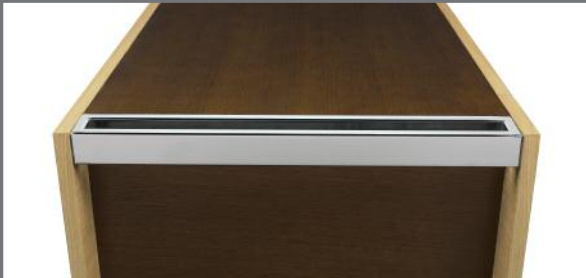
SERVING CART: HANDLE