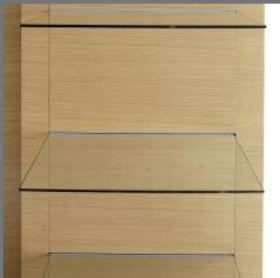
DISPLAY WALL GLASS SHELF