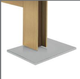
TABLE: BASE AND FOOT