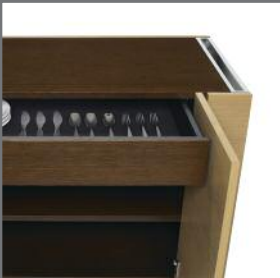
SERVING CART: CUTLERY DRAWER