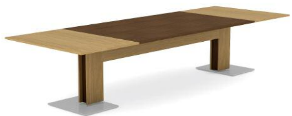
MODULAR WITH TECHNOLOGY TROUGH UNIFORM FINISHED DOORS