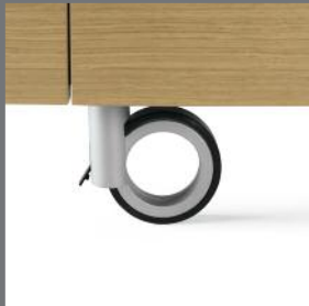
SERVING CART: CASTERS